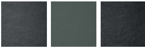
Granit 648 Schiefergrau 651 Schwarz 650