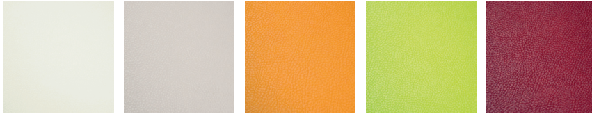
Sand 644 Birke 646 Mango 640 Limone 642 Kirsche 641