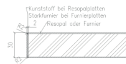
Plate D: 30 mm thick, 28 mm thick high-quality multi-layer plywood plate E1, top surface optionally covered with HPL plastic or wood veneer according to the BRUNE® collection. Lower surface white HPL or beech veneer. Edge with solid beechwood edge band, smooth finish, 9 mm thick.

Plate C: 30 mm thick, high-quality multi-layer plywood plate E1, top surface optionally covered with HPL plastic or wood veneer according to the BRUNE® collection. Lower surface white HPL or beech veneer. Straight edge, 2 mm thick, in material to match table top (plastic for plastic, veneer for veneer).